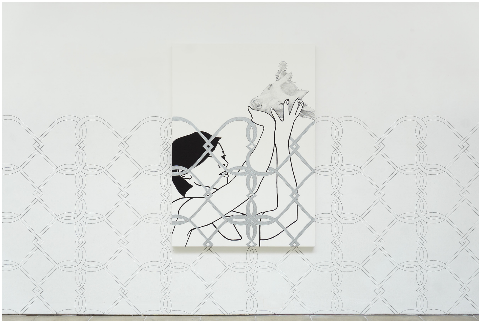
Atonement, 2024 170 x 4.5 x 120 cm Moulding paste, metallic paint, acrylic paint and graphite on canvas