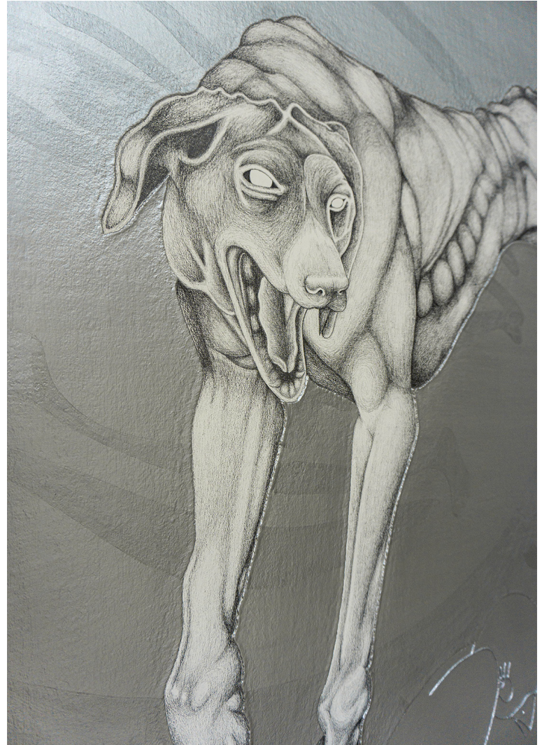
Earthbound Desire , 2024 170 x 4.5 x 120 cm Moulding paste, metallic paint, graphite, glossy varnish on canvas