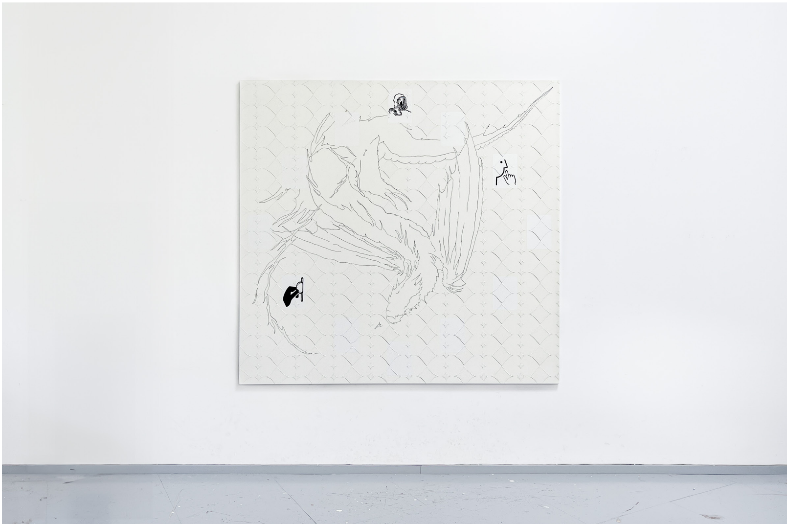
Psst, Only Perfection , 2023 190 x 2.5 x 200cm Moulding paste, acrylic paint and graphite on canvas