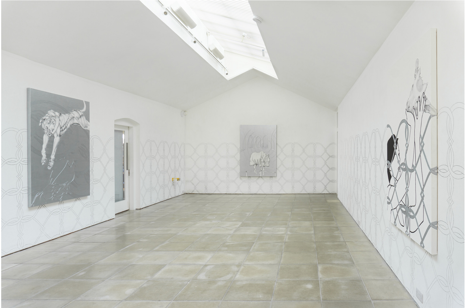
friends are forever ; 2024 Installation view at spudWorks New Forest National Park Residency (UK)