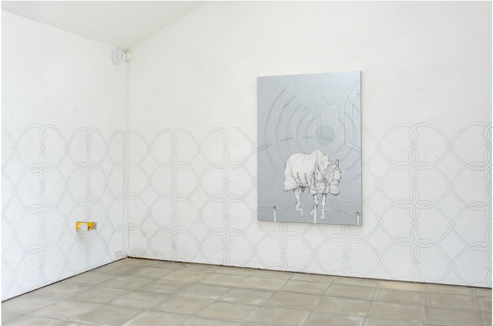
Industrial Illusion, 2024 170 x 4.5 x 120 cm Moulding paste, metallic paint, graphite and varnish on canvas